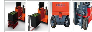
Option battery side pulling